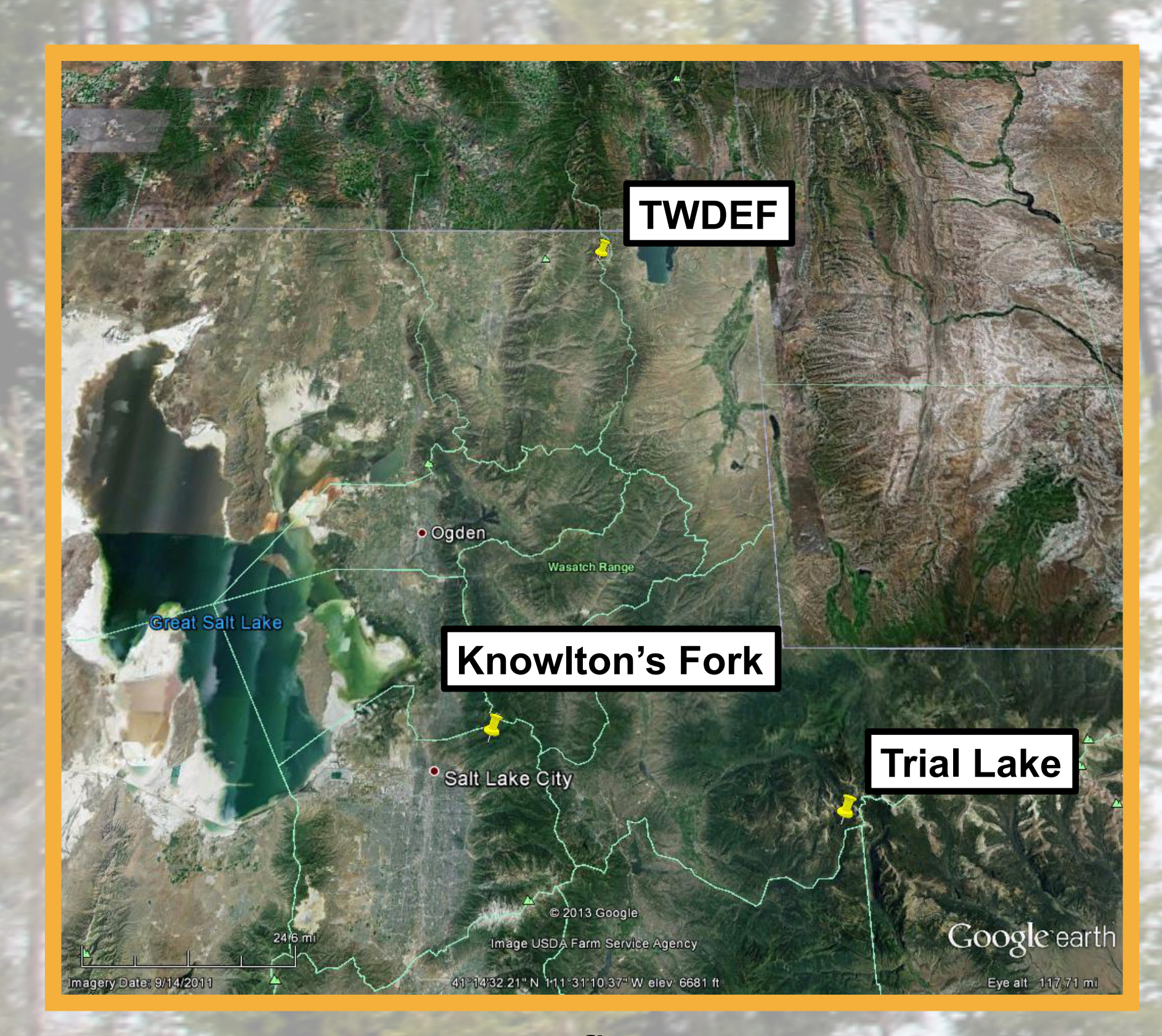
Figure 1. Montane sap flux sites.

Quantify stand-level transpiration and snowpack dynamics in montane coniferous forests along an elevation gradient in the iUTAH watersheds to determine the relative influences of temperature and snow water equivalent (SWE) on water availability for the Wasatch Range Metropolitan Area